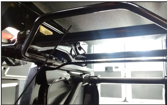
Seat cover bottom flap, running OVER all bars, wires, etc.